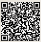
Dixon Customer Service